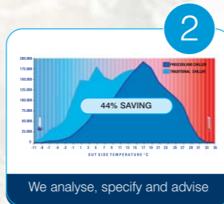
We analyse, specify and advise