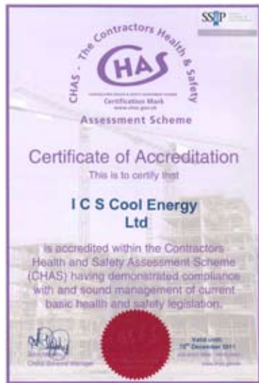
ICS Cool Energy on CHAS website

The Scheme is recognised as a market leader in the UK for health and safety qualification and competence for suppliers of services and goods.