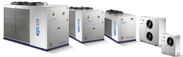
The Cygnus Group of Energy Efficient Chillers

In addition to the threshold changes, SME private sector businesses in England and Scotland with an annual electricity spend of less than £500,000 are now able to apply for an energy efficient loan.