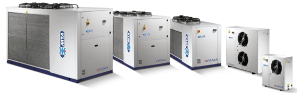
The Cygnus Group of Energy Efficient Chillers

In addition to the threshold changes, SME private sector businesses in England and Scotland with an annual electricity spend of less than £500,000 are now able to apply for an energy efficient loan.